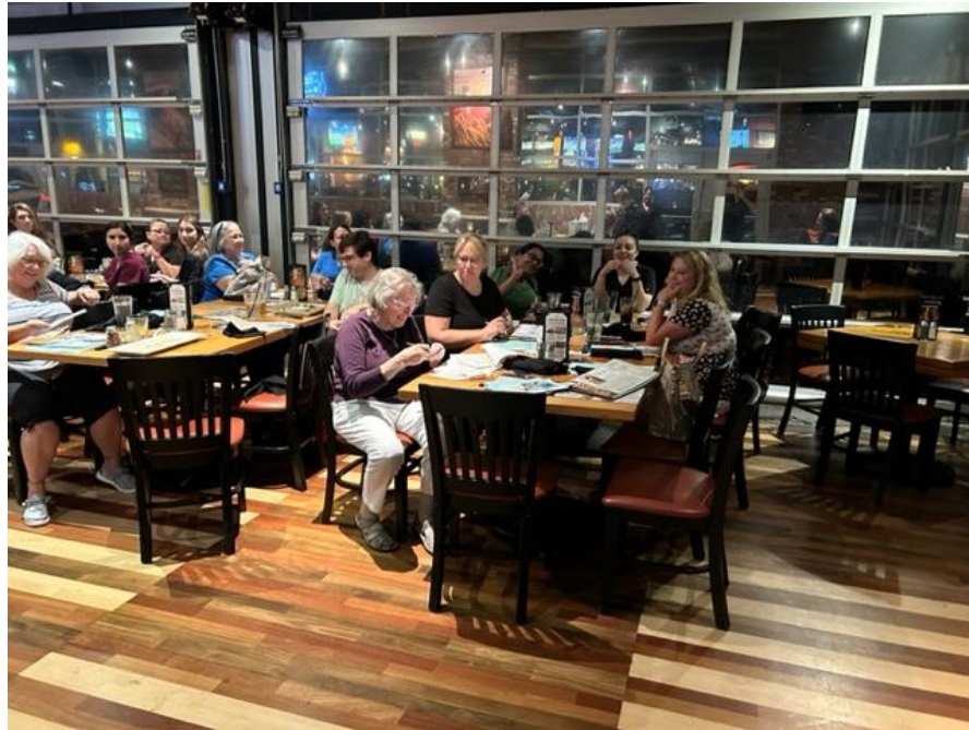
Meeting on sleep disorder