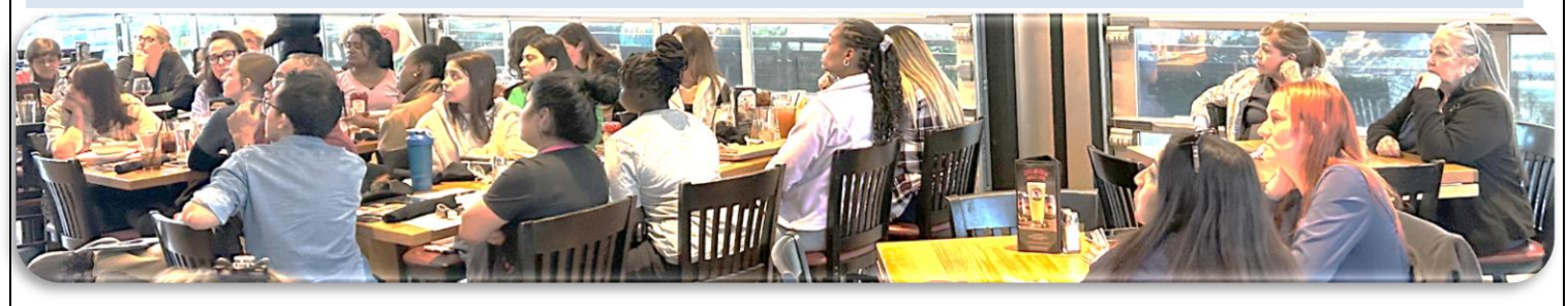
Lecture on Equipment Performance Evaluations

Dallas County Dental Assistants Society DRAW Activities