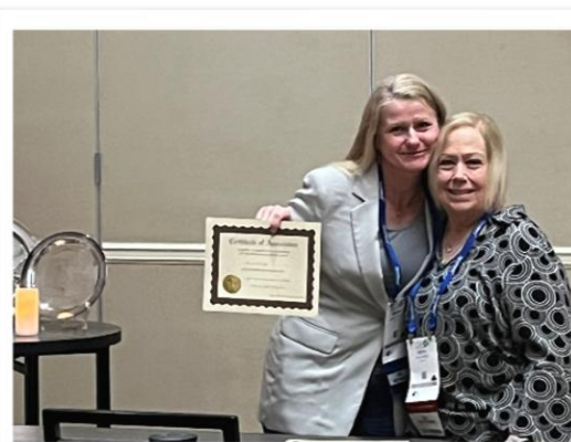
Certificates of appreciation