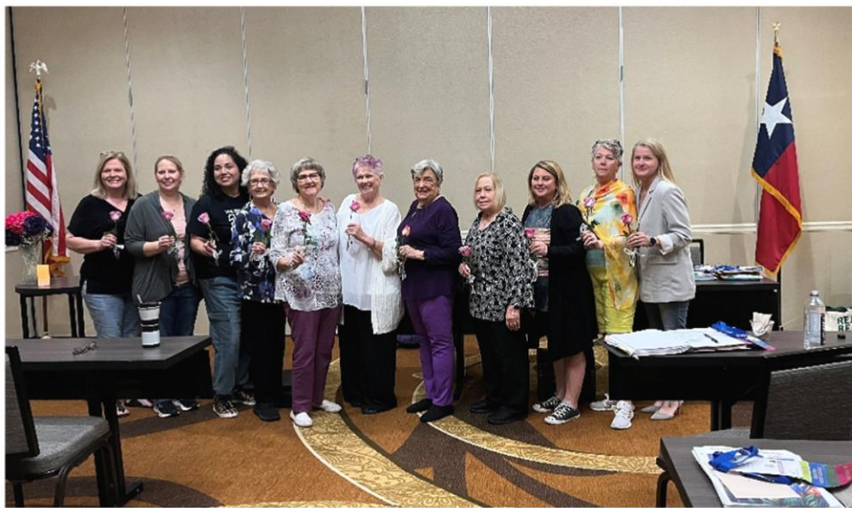
2025-2027 TDAA Board